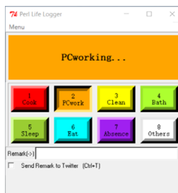
Figure 4 Lifelog tools UI

For supervised learning, the system needs to train data that have the correspondence between the ADLs and sensors data in advance. To label the sensor data, we developed a API, which we will