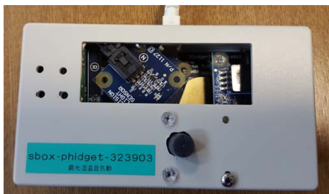
Figure 3 SensorBox

The sensor equipment was developed by our research group [16], which measures various indoor environmental data by using environment sensors included temperature, humidity, lighting intensity, atmosphere pressure, sound volume, human motion and vibration. In additional, we developed an indoor environment sensing service using autonomous SensorBox that can be easily deployed without cost-intensive infrastructure and configuration labour. Figure 3 shows its physical form. Logger in SensorBox, in every time of measurement, create data and modify to JSON formal text, then upload to the Mongo Database.